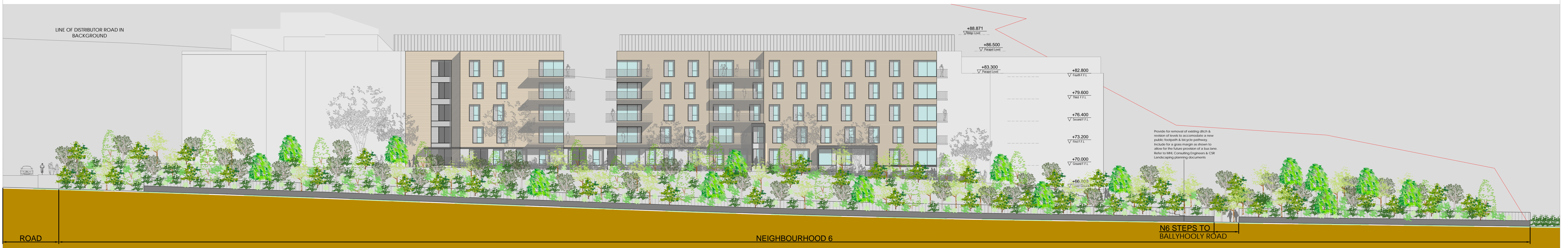
Ballyhooley Road Section Part 4 of 5 SCALE 1:200 @ A0