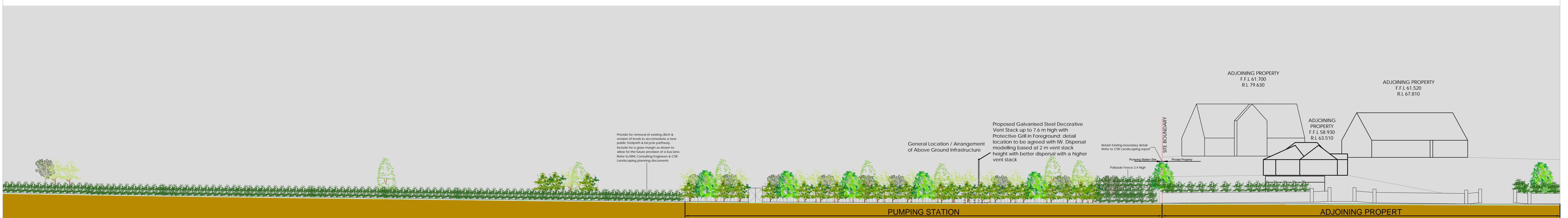
Ballyhooley Road Section Part 5 of 5 SCALE 1:200 @ A0