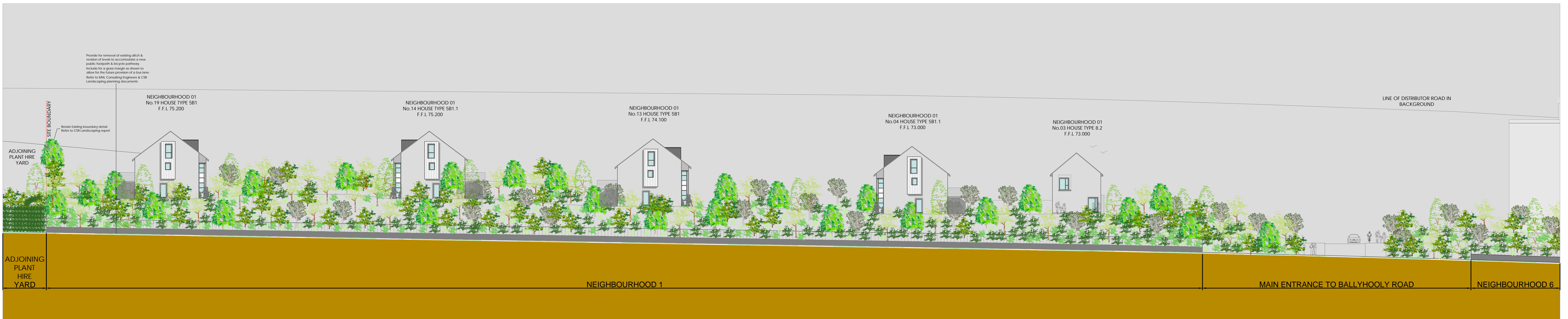
Ballyhooley Road Section Part 3 of 5 SCALE 1:200 @ A0